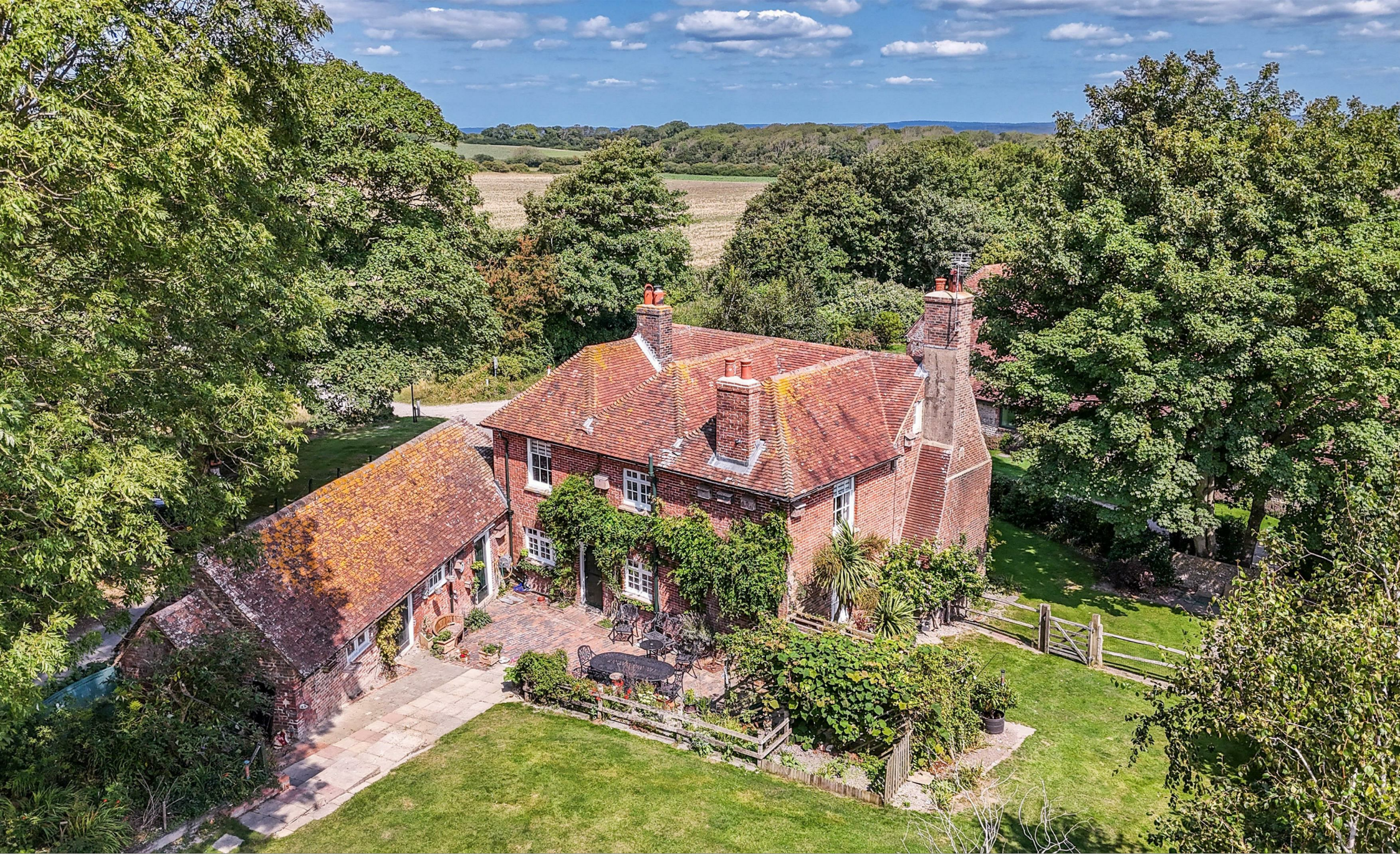
Bo-Peep Farmhouse Bo-Peep Lane, Alciston, BN26 6UJ